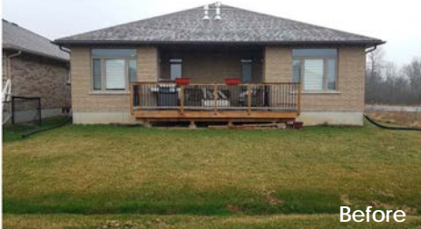
Napanee—Completed in July