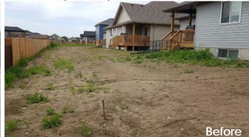
Belleville—Completed in September