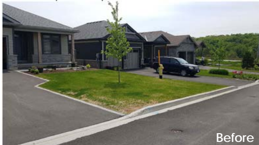
Picton—Completed in September